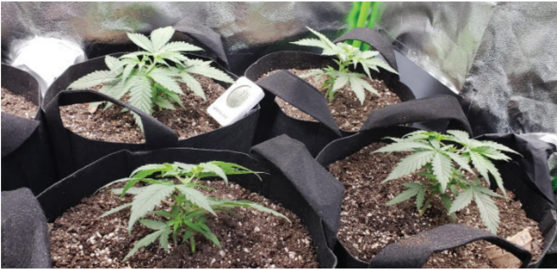
Terp Smoothie 1st week of vegetative growth plants are around 4"-6" tall.