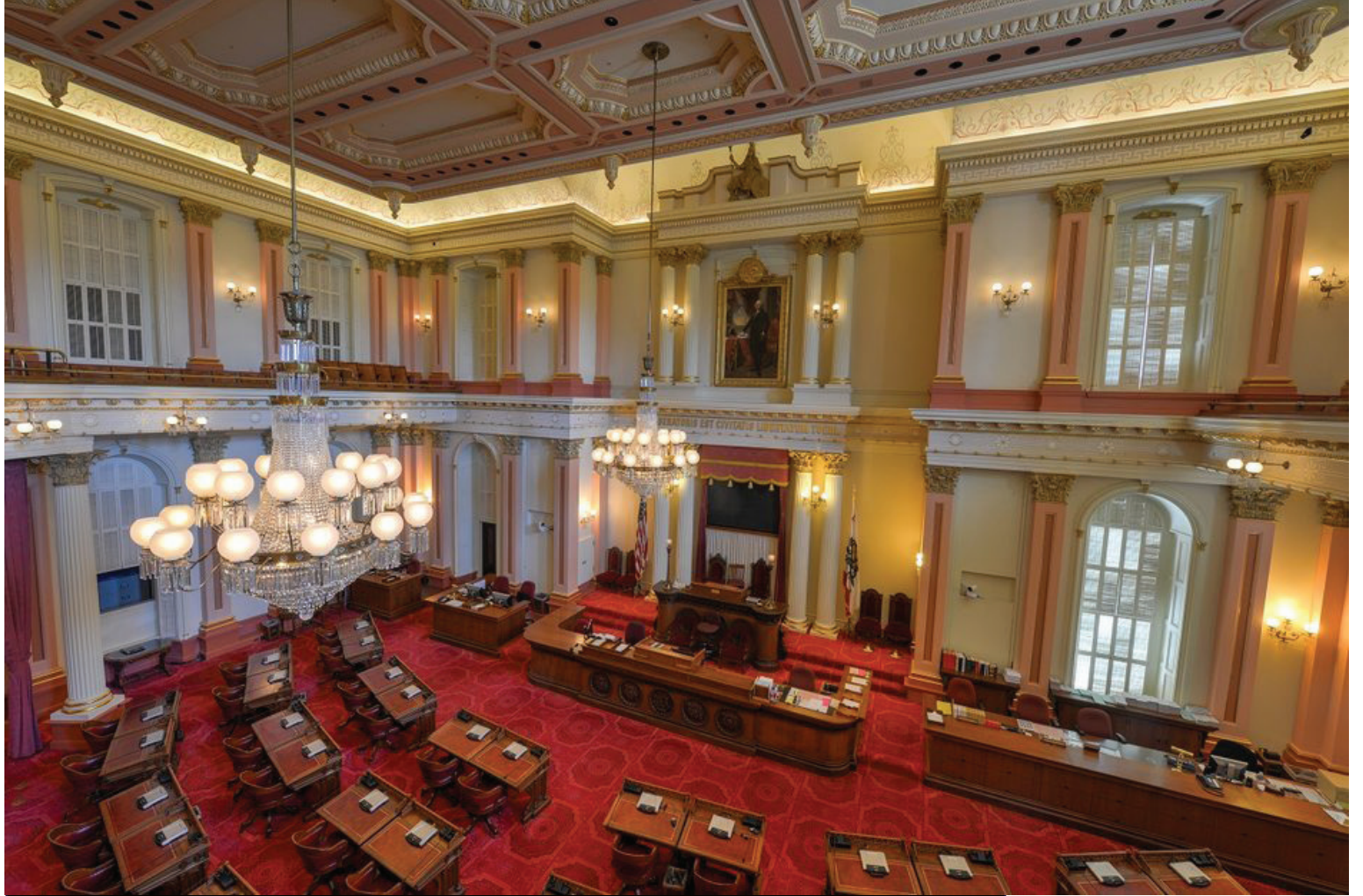
CA Senate floor, via govtech.com.

Legislation Introduced for Protecting States Rights pg 6