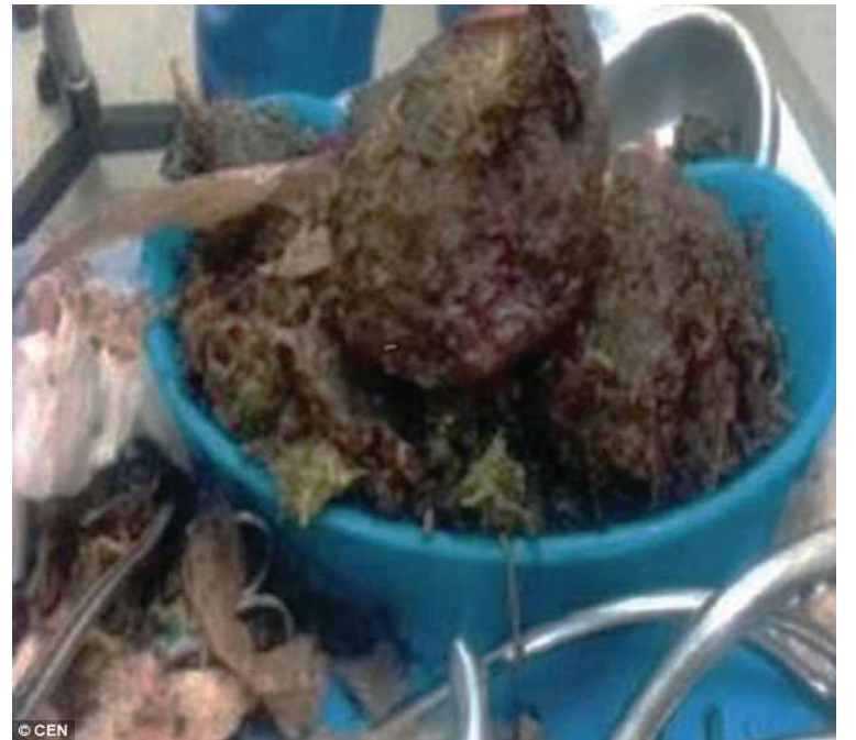
1 kg of cannabis removed from a woman's body

In a Tuesday press conference, officials announced that they would be appropriating $2.5 million in federal funds to combat unlicensed cultivation operations that are threatening California forests and wildlife.