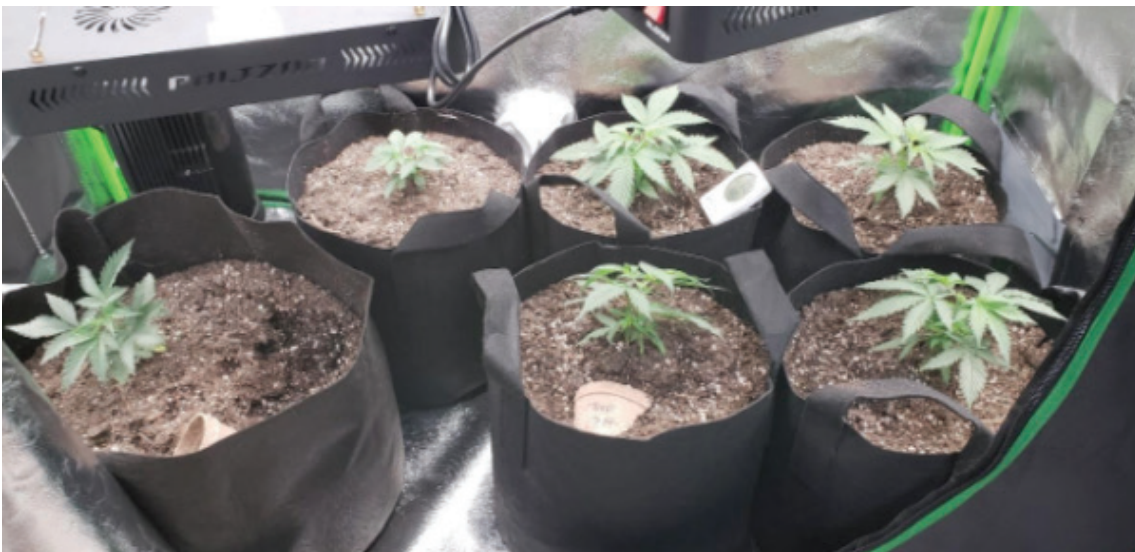
Calico Jacks on the left and Terp Smoothies on the right.

Additionally, you will note that I have 1 Calico Jack in a much larger pot, it is in a 10-gallon pot. My plan is to let it grow outside once it is a little bigger.